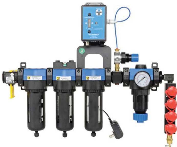
Model Shown: 380-4SA446

Master Pneumatic's breathing air assembly is designed to provide breathing air for up to 4 workers.