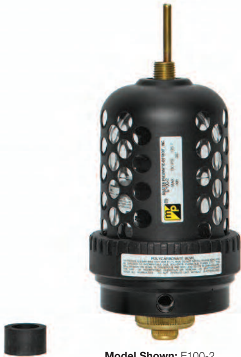
Model Shown: E100-2

When the hydro-jector is installed into a filter drain, use the supplied rubber spacer between both products. This will allow greater stability with the Hydro-Jector.