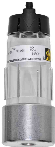
Model Shown: 482R

Servo-Meters can be supplied with oil by pressure systems (up to 30 psig) or gravity systems, although gravity systems are generally preferred. Remote reservoirs should be connected to the bottom port of the SERV-OIL equipment with a minimum 5/16" I.D. line.