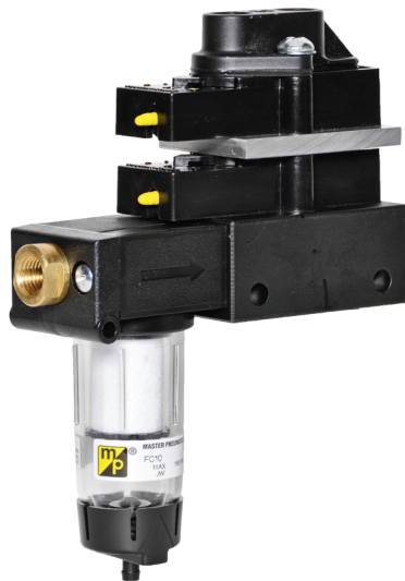
Model Shown: PC100-2

The PC100 controller has been designed to supply a consistent and accurate way of lubrication. This is done by providing an actuation every 1, 5, 10, 25, 50 or 100 pulses supplied off the inlet air. The inlet air must also be in the form of an on-off signal as would be received from downstream of an operating valve. This controller allows the pulse of air to be actuated at as little as 100 times in inlet air signal and is most often used to control lubrication in M/P's Serv-Oil systems.