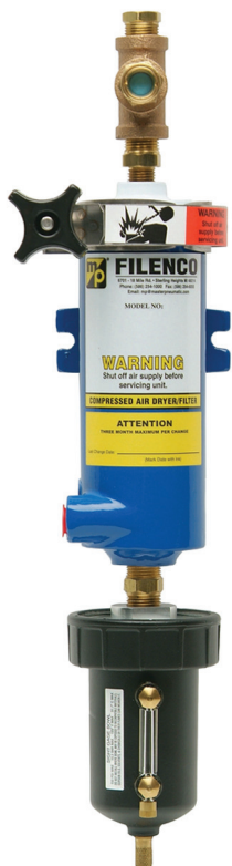
Model Shown: CD25-2D3M