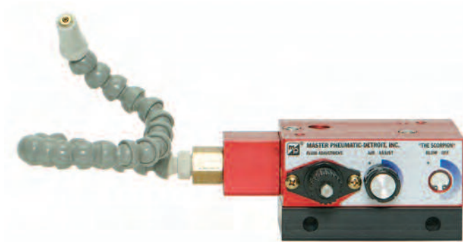
Model Shown: 8901