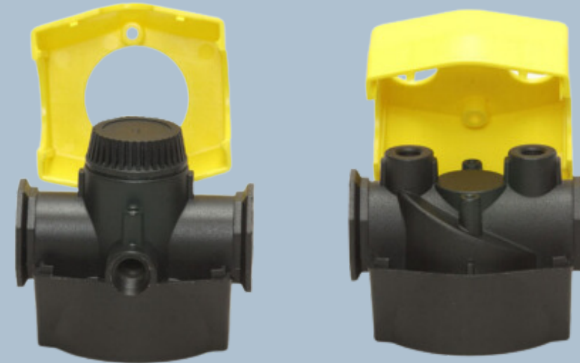
REMOVABLE ADJUSTMENT KNOB (SHOWN WITH DRAIN TUBE)